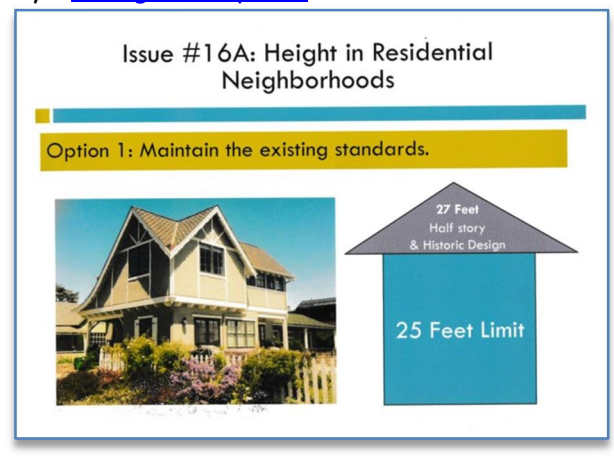
Height limits are a major topic

In the meantime if you would like a fuller explanation of the updating process for the Zoning Code, see the City's zoning code update.