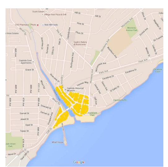
Highlighted areas indicate the only locations in Capitola where permits for short-term rentals of residences are available. For details, see the cityos Transient Rental Overlay map

vacation rental properties operating illegally in Capitola's residential neighborhoods. Numerous complaints have been filed with the City regarding this growing problem. Complaints center on exacerbated parking problems, noise, late night parties, a constant turnover of strangers and an elevated level of activity typical of the party atmosphere of vacation rentals. Residents feel that this activity conflicts with the quiet enjoyment of their R-1 neighborhoods and that it changes the nature of their residential neighborhoods. They feel that this is the reason the City created the Transient Overlay District in the Village area where more activity, congestion and parking challenges of vacation rentals are more the norm.